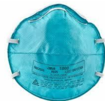
N95 Face Mask