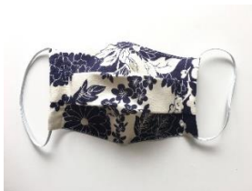
Three-Layer Cotton Homemade Face Mask, with PM2.5 filter inserted

Each test subject was given the same sentence to read, first without a mask and then while wearing each of the masks below: