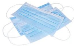
Surgical Face Mask